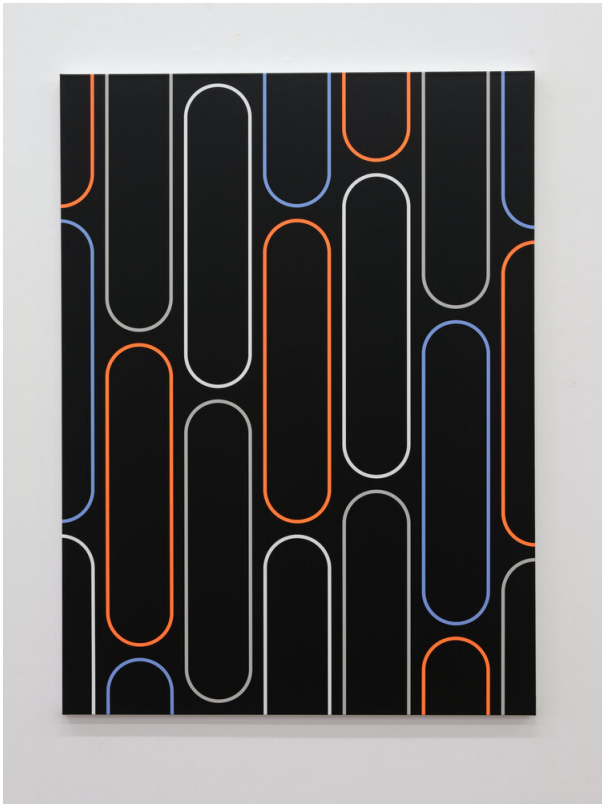
Jan van der Ploeg, PAINTING No. 21-01, Untitled, 2021, 115 x 85cm, acrylic on canvas