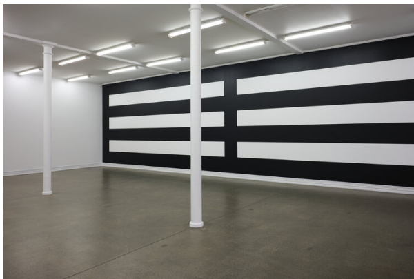
Jan van der Ploeg, The Other Window , installation view, Starkwhite