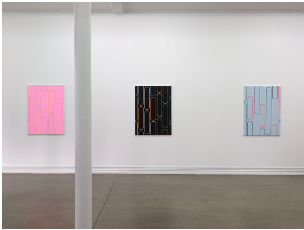
Jan van der Ploeg, The Other Window, installation view, Starkwhite