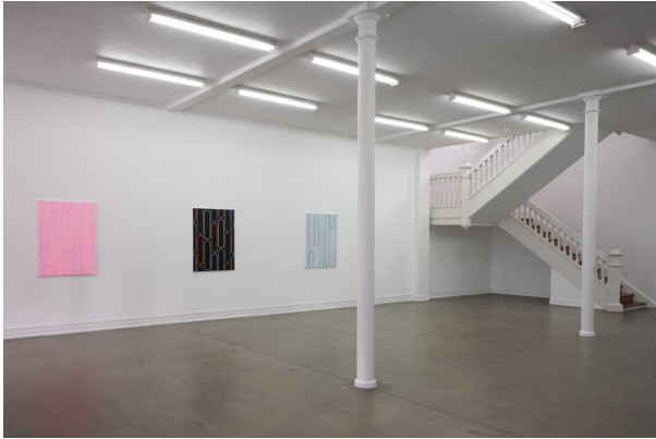
Jan van der Ploeg, The Other Window, installation view, Starkwhite