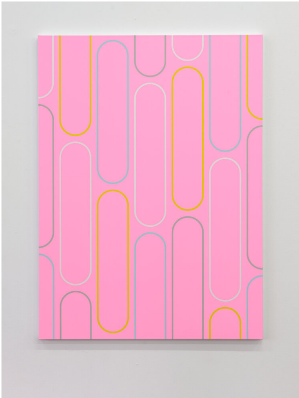
Jan van der Ploeg, PAINTING No. 21-03, Untitled, 2021, 115 x 85cm, acrylic on canvas