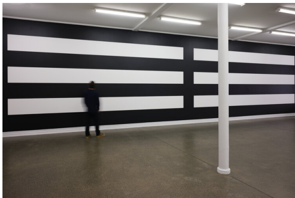
Jan van der Ploeg, The Other Window , installation view, Starkwhite

Jan van der Ploeg | The Other Window | 17 August to 12 October