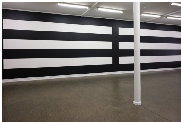
Jan van der Ploeg, The Other Window , installation view, Starkwhite