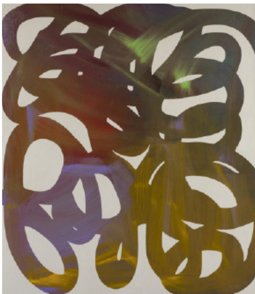
9 Gemma Smith Double Time , 2020 Acrylic on board 137 H × 117 W cm