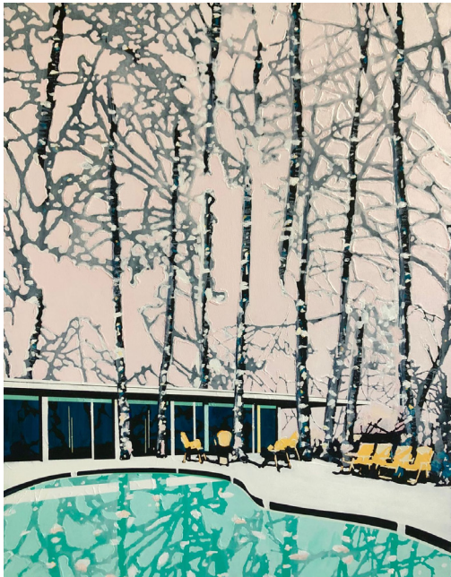
4 Paul Davies Pink Forest Blue Pool , 2022 Acrylic on canvas 122 H × 91 W cm