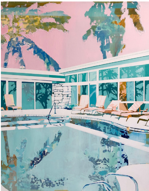
5 Paul Davies Palm Tree House and Pool , 2022 Acrylic on canvas 122 H × 91 W cm